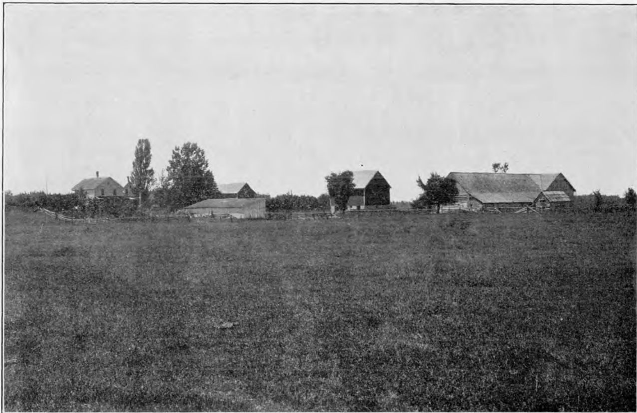
TYPICAL DAIRY FARM ON MIAMI SANDY LOAM. SEC. 10, T. 31, R. 22 E.