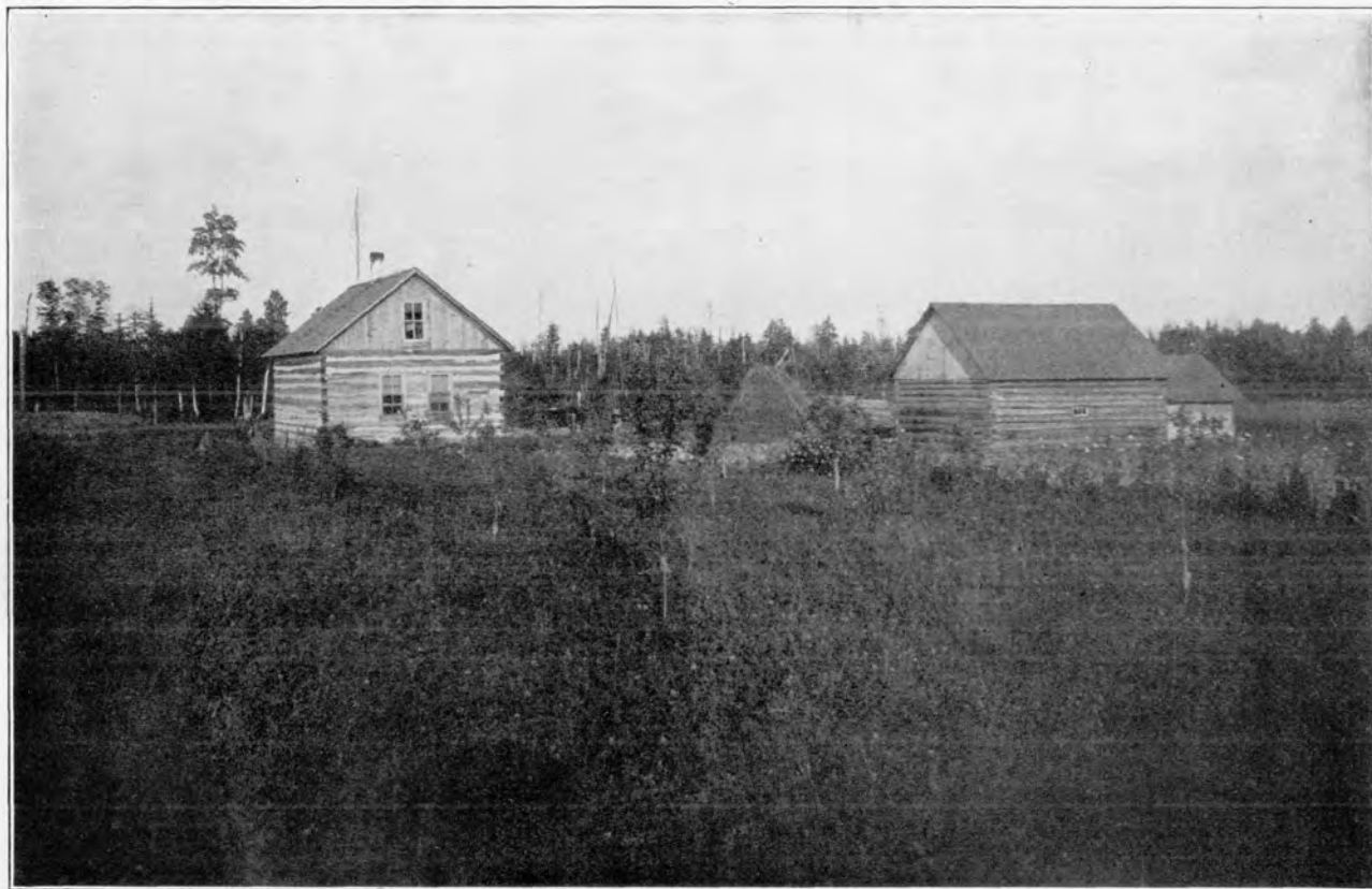
A CHARACTERISTIC HOME OF A NEW SETTLER ON THE COLOMA FINE SANDY LOAM, T. 31, R 20 E. A SMALL ORCHARD AND CLOVER FIELD IN THE FOREGROUND.