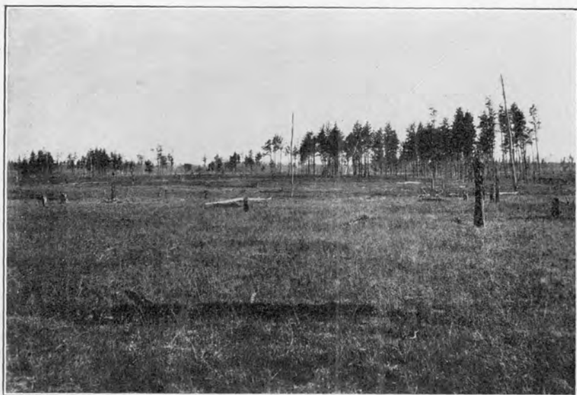
FIG. 1. TYPICAL VIEW OF PLAINFIELD SAND, UNDEVELOPED, JACK PINE PLAINS. SEC. 4, T. 36, R. 20 E.