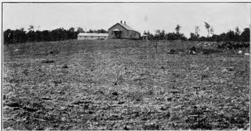
FIG. 2. VIEW OF NEWLY CLEARED FIELD ON COLOMA LOAM AT GOODMAN.