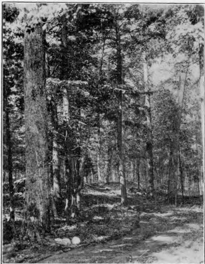
FIG. 1. VIEW OF COLOMA LOAM SHOWING TYPICAL DENSE HARDWOOD FOREST NEAR GOODMAN.