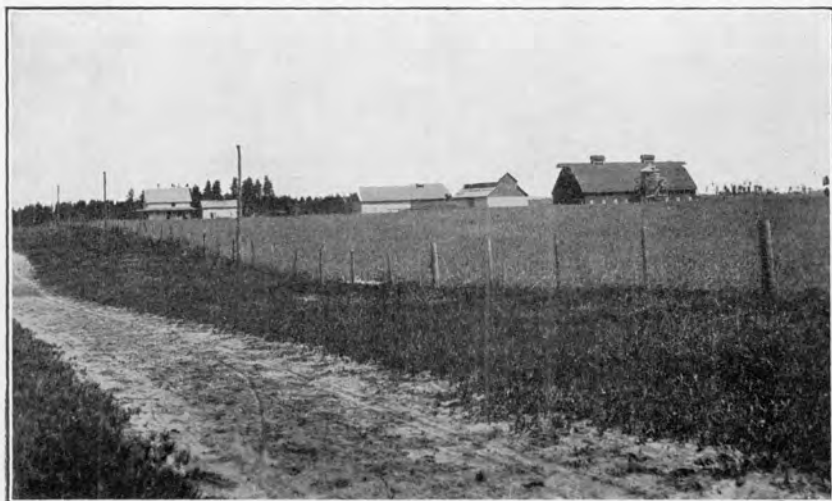
FIG. 2. VIEW OF FARM DEVELOPED ON THE PLAINFIELD SAND. SEC. 5, T. 34, R. 20 E.