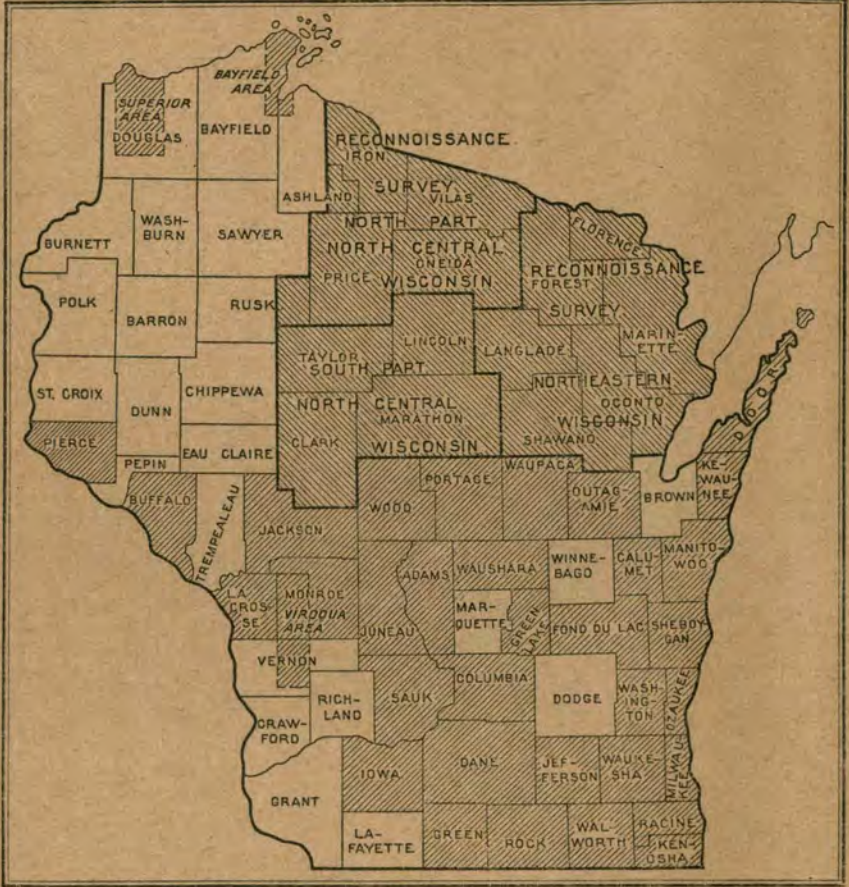
Areas surveyed in Wisconsin, shown by shading