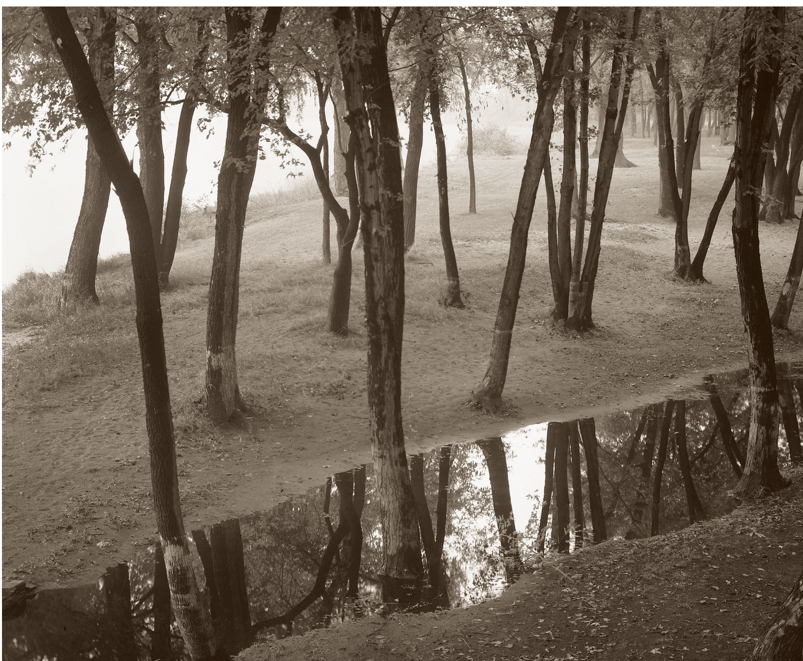
TREES AND REFLECTING WATER AT PAUQUETTE PARK ALONG THE WISCONSIN RIVER IN PORTAGE. (PHOTO BY PAUL VANDERBILT, 1962)