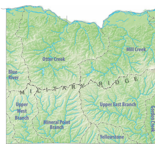
Figure 1. Locations of surface-water divides (dotted lines) in Iowa County.

The water-table elevation map has been generalized from a larger, more-detailed version. Copies of the full-sized map and additional information about the groundwater resources of Iowa County are available from the Wisconsin Geological and Natural History Survey.