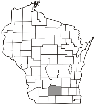
Location of Dane County